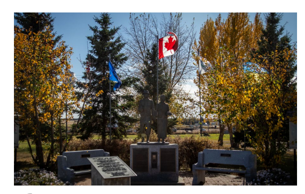
Thank you to those who came before us so that we can celebrate and enjoy our country....Happy Canada Day!!