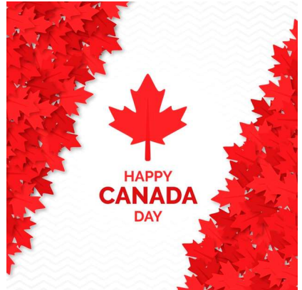
July 1 2021

Canada Day celebrates the birthday of Canada. 154 years ago, On July 1, 1867 Canada became a new federation with its own constitution by signing the Constitution Act formerly known as the British North America Act.